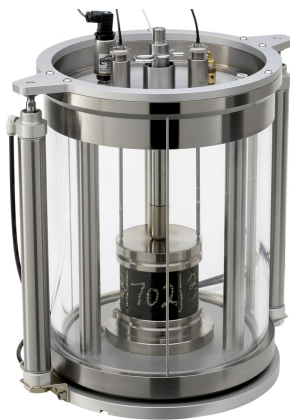
Triaxial test - Automatic triaxial cell for UTM 79-PV70330