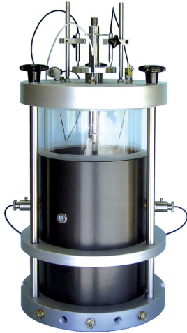
Triaxial test - Universal triaxial cell for UTM 79-PV70300